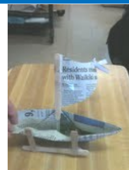
These wa'a were created by Pono Choices students as part of an 'Ohana activity

“Your project with the canoe and the braid was such a wonderful tool for the students to learn from. Please know your class is a critical component to the students learning and should be all year round.” -email from a parent