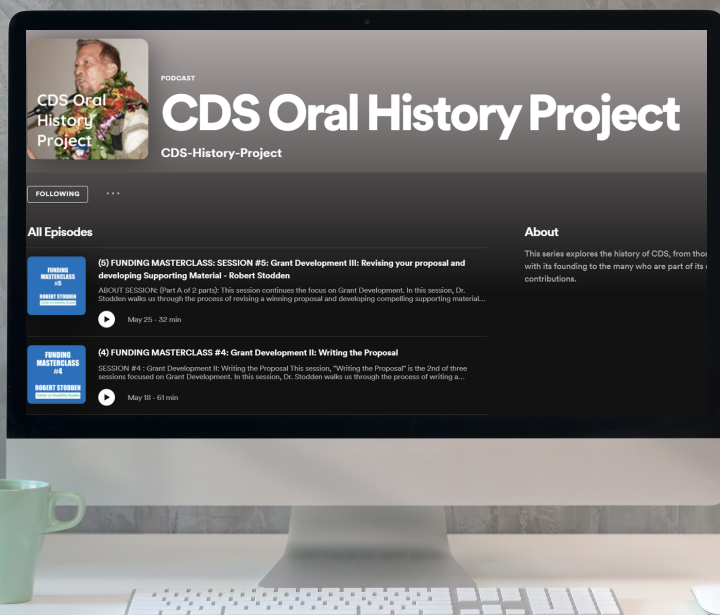
Photo of desktop computer with CDS Oral History Project Spotify website

In addition to interviews gathered in the project, the collection will eventually also be part of a physical campus exhibition celebrating the history and ongoing work of CDS.