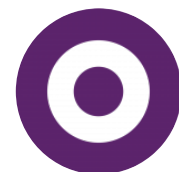
Jobs Now logo