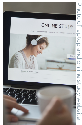
Photo of laptop and online study website