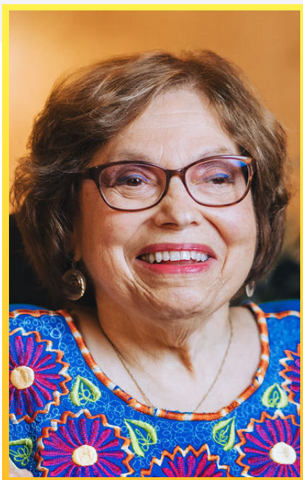
Photo of Judith E. Heumann