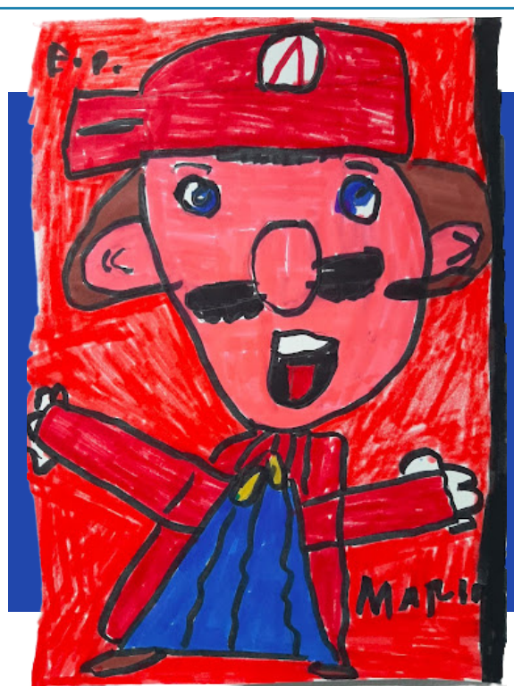
Super Mario (2022) Perriera, Wailuku, Hawai'i

Interested in being included in the next newsletter? Submit a request by the fourth Friday of each month at http://go.hawaii.edu/JBJ.