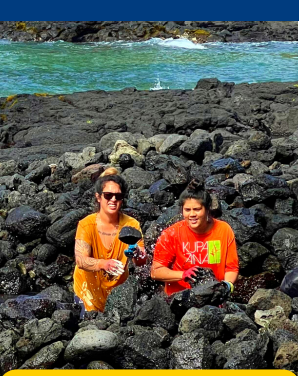
Science Exploration within Native Hawaiian Culture