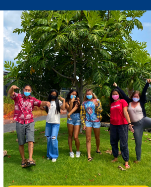
Paid Summer 2024 Internship and Mentoring