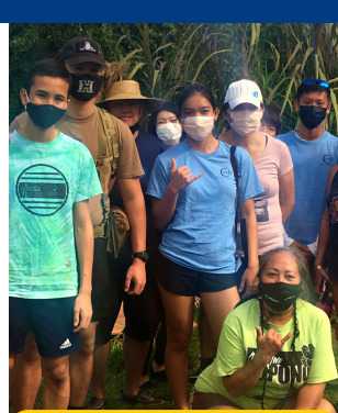
'Ohana Hands-on Culture Activities At-home Resources