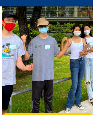
Hands-on Science Activities