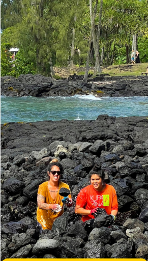
Science Exploration within Native Hawaiian Culture