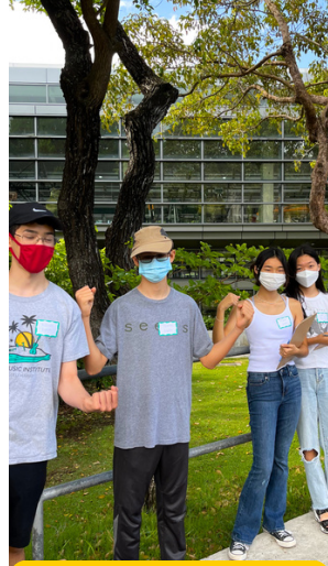
Hands-on Science Activities