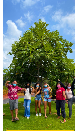
Paid Summer 2024 Internship and Mentoring