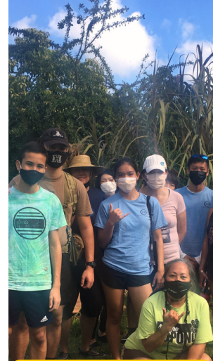
'Ohana Hands-on Culture Activities At-home Resources

2023-2024 PROJECT HÖKŪLANI STUDENT RECRUITMENT